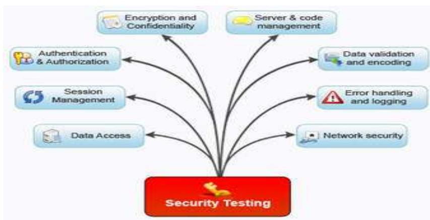
Fig 2. WS-Security assertion matching

This is done in a transport-neutral fashion. OASIS proposed “The Web Services extensible Access Control Language (WS XACML)” as XML based language to specify and exchange access control policies.